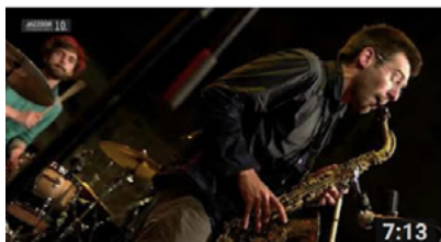
« KOMBINOWACY » LIVE AT JAZZDOR BERLIN 2016