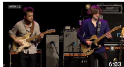
« MAMESY » LIVE AT JAZZDOR BERLIN 2016